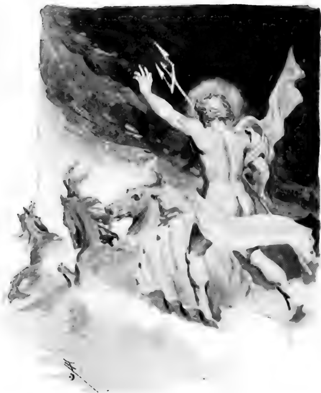
"WIELDING IN HIS HAND THE TRIDENT, SUMMONED ALL THE HURRICANES."—Page 291.